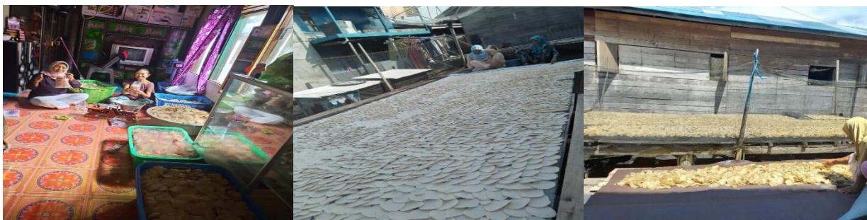
Figure 4. One of the Skill Development Training Outcomes by PPL on Fish-Based Cracker Processing in Pegatan Village, Pegatan Hilir Subdistrict, Katingan Regency.

The skill and expertise training aims not only to increase productivity but also to create opportunities for economic diversification. For instance, the PPL's initiatives in Pegatan Village involve empowering the coastal community to develop businesses based on local resources. This includes training fishermen's wives in processing fish catches into value-added products, such as making fish-based crackers, shrimp paste, and salted fish. For example, fish-based cracker training covers the entire process, from preparation and drying to packaging. By implementing these initiatives, the community can diversify their income sources, ensuring greater economic resilience and independence for the coastal population in Pegatan Village.