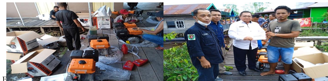
Figure 2. Fishermen's Equipment Assistance in 2023 in Pegatan Village, Pegatan Hilir Subdistrict

However, fishermen often face challenges related to inadequate equipment and facilities, which can directly impact their safety and productivity while working at sea. Pegatan Hilir Subdistrict acts as a mediator and facilitator, bridging the needs and aspirations of the coastal fishing community. Through its role, Pegatan Hilir Subdistrict can accommodate community proposals and facilitate access to fishing equipment assistance by coordinating with the Regency Government, specifically the Fisheries and Marine Affairs Office of Katingan Regency. With proper mechanisms and targeted strategies for providing fishing equipment assistance, it is expected that fishermen's welfare will improve, encouraging the community in Pegatan Village to maximize the economic potential of the coastal region.