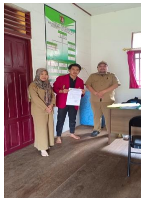
Figure 2. Conducting Research and Interviews at the Pegatan Hilir Subdistrict Office

"Pegatan Hilir Subdistrict strives to support the community in Pegatan Village by managing facilities provided by the Regency Government, enhancing skills, and fostering institutional development, such as forming fisher group leaders. These are the types of programs we have implemented so far."