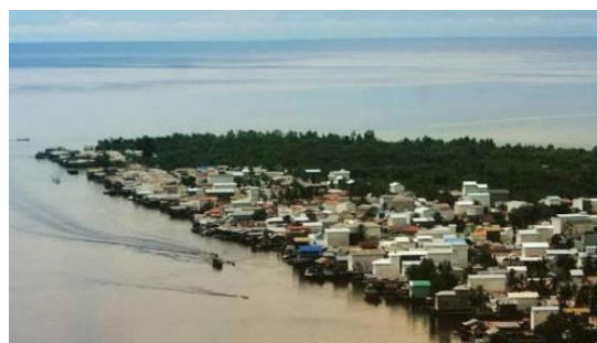
Figure 1. Portrait of Pegatan Village, Pegatan Hilir Subdistrict

Economically, most of the residents of Pegatan Hilir work in the fisheries sector, including both capture fisheries and aquaculture. Additionally, local residents are engaged in agriculture, trade, and small-scale services. The main commodities of Pegatan Hilir include marine catches such as fish and shrimp.