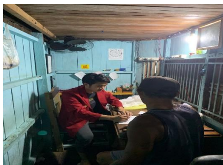
Figure 5. Interview with the Institutional Leader in Pegatan Village

Another limitation is the lack of coordination and collaboration with external parties, which has prevented the community from receiving external assistance that could be beneficial. By addressing these issues through continuous improvement and optimizing institutional coordination, the Institutional Strengthening Strategy can better maximize its impact on community welfare, ensuring it is well-directed and effectively structured.