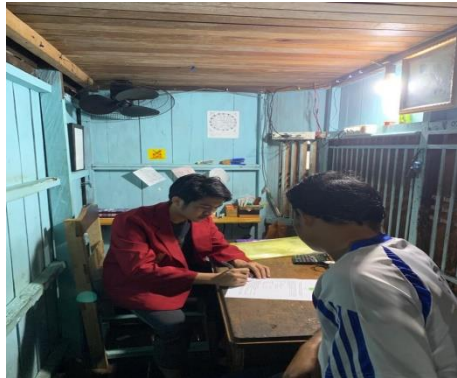
Figure 3. Interview with a Coastal Community Member (Fisherman) in Pegatan Village

Through observations and interviews with other residents, the researcher concluded that the district government and Pegatan Hilir Subdistrict have not conducted follow-up monitoring of how the community optimizes the use of the provided assistance. This lack of oversight has inadvertently led to new issues.